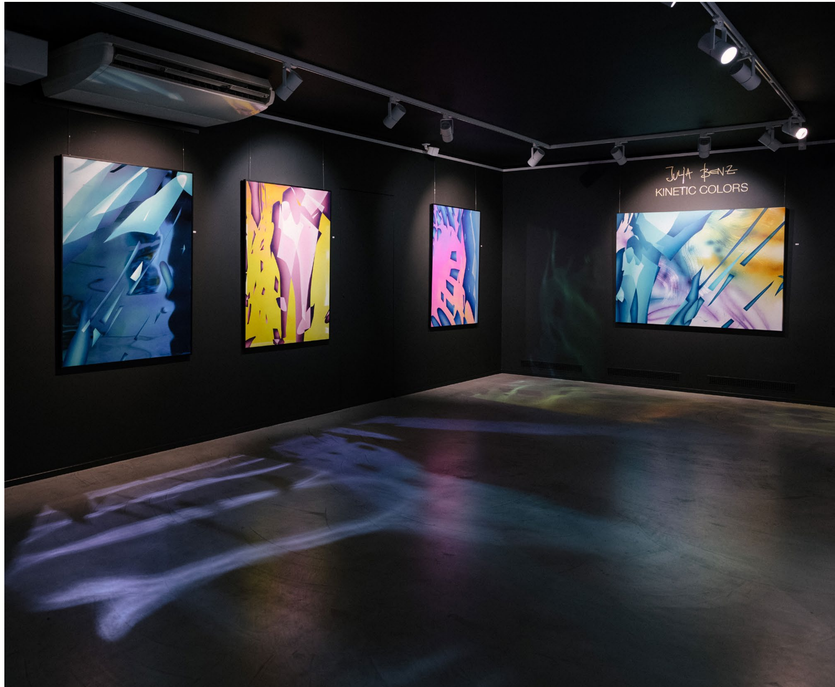
solo exhibition at Galerie Gerald Hartinger – Vienna, Austria