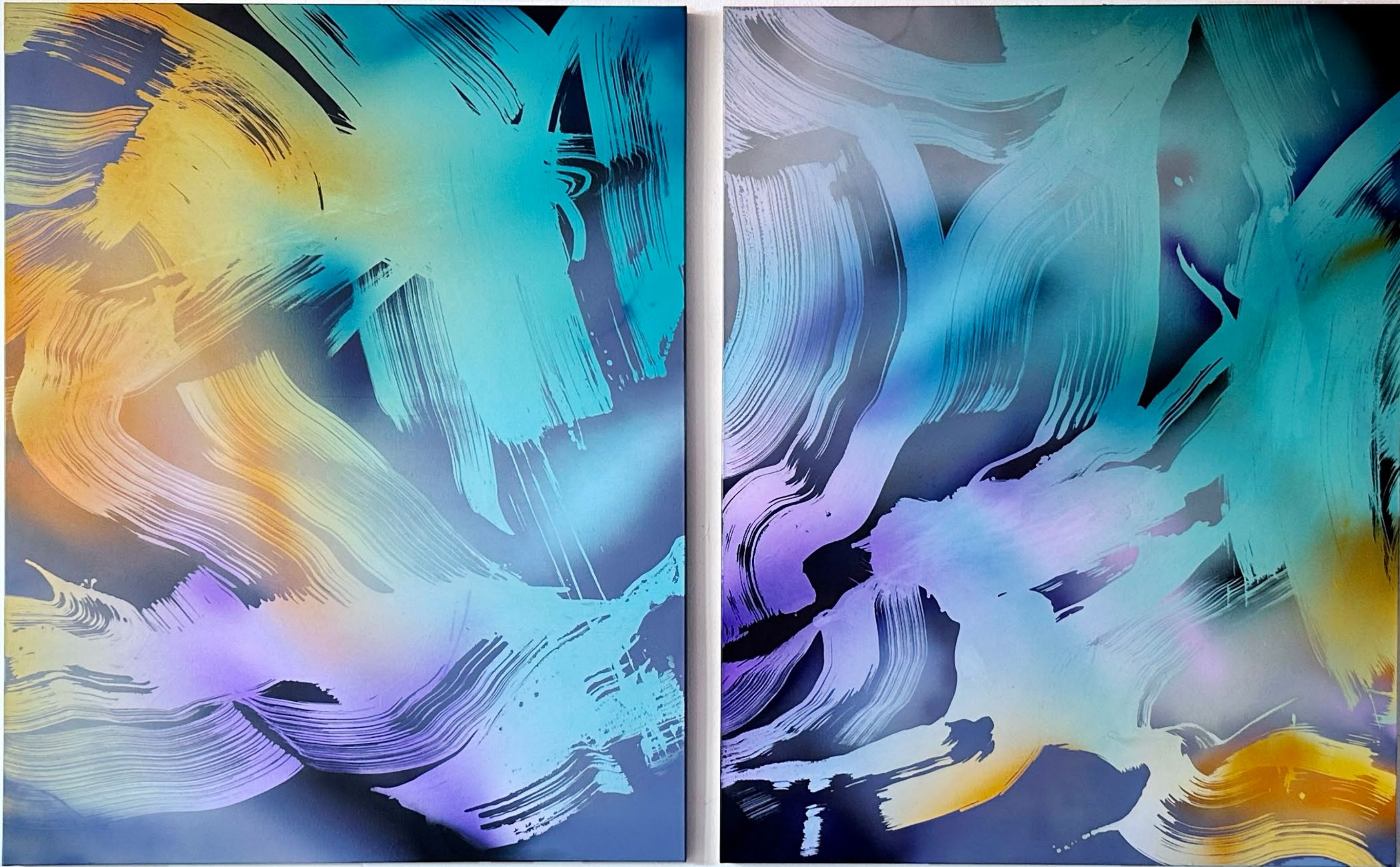
Time moves slow I+II