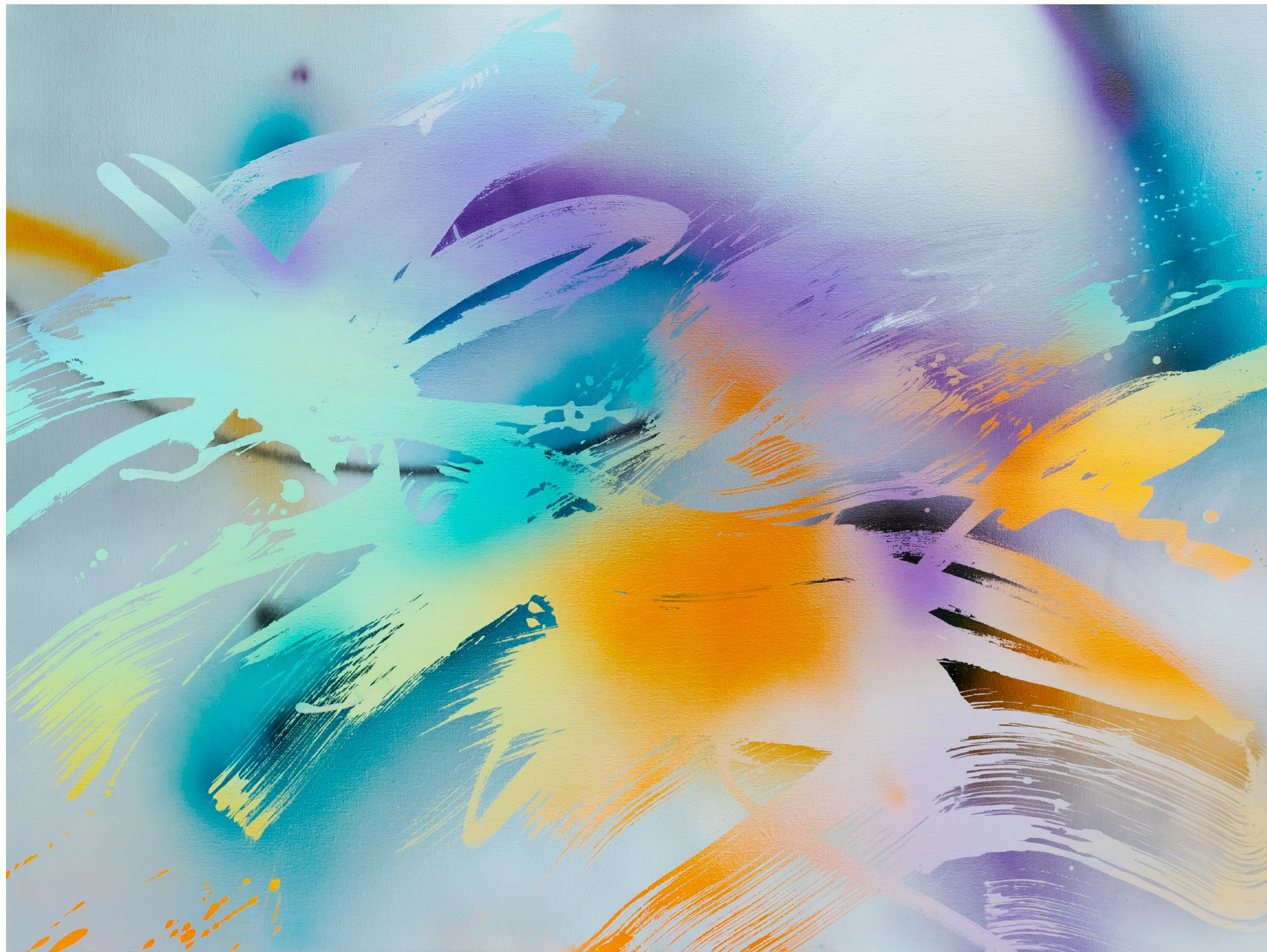
soft af 130 x 100 cm acrylics on canvas 2023