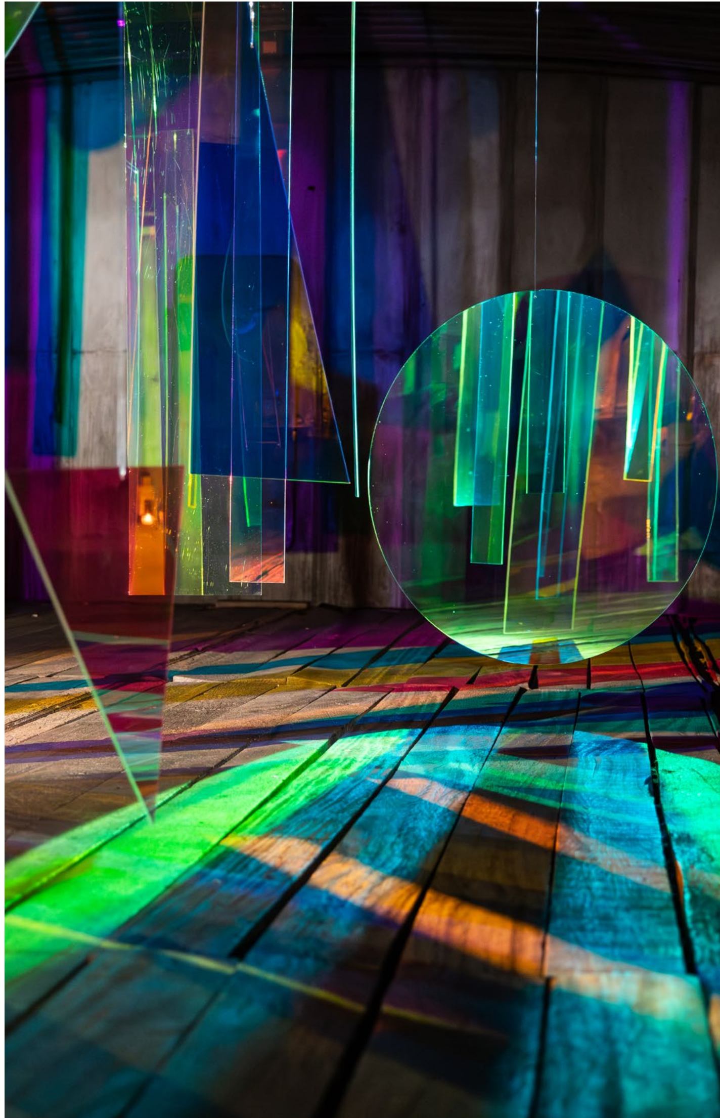
solo exhibition Hosek Contemporary – Berlin, Germany