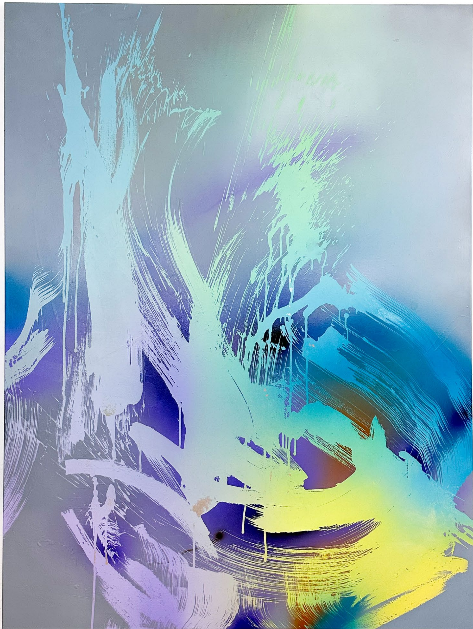
symphony 200 x 150 cm acrylic on canvas 2023